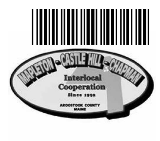
THIS IS THE ONLY BILL YOU WILL RECEIVE