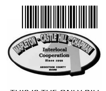
THIS IS THE ONLY BILL YOU WILL RECEIVE