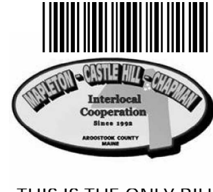
THIS IS THE ONLY BILL YOU WILL RECEIVE