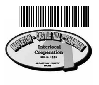
THIS IS THE ONLY BILL YOU WILL RECEIVE

LOCATION: 3483 WEST CHAPMAN RD BOOK/PAGE: B5767P149 04/20/2018