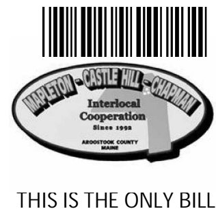
THIS IS THE ONLY BILL YOU WILL RECEIVE