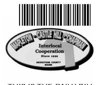
THIS IS THE ONLY BILL YOU WILL RECEIVE