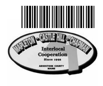
THIS IS THE ONLY BILL YOU WILL RECEIVE

BOOK/PAGE: B3710P195 B3708P275 08/20/2002