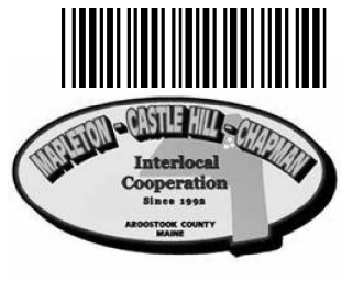
THIS IS THE ONLY BILL YOU WILL RECEIVE

LOCATION: 2160 CHAPMAN RD BOOK/PAGE: B3576P242 10/23/2001